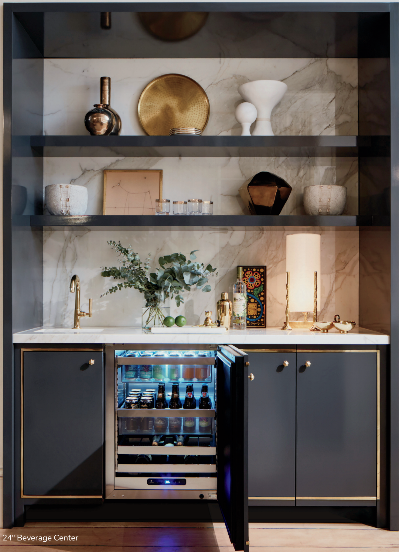
24" Beverage Center