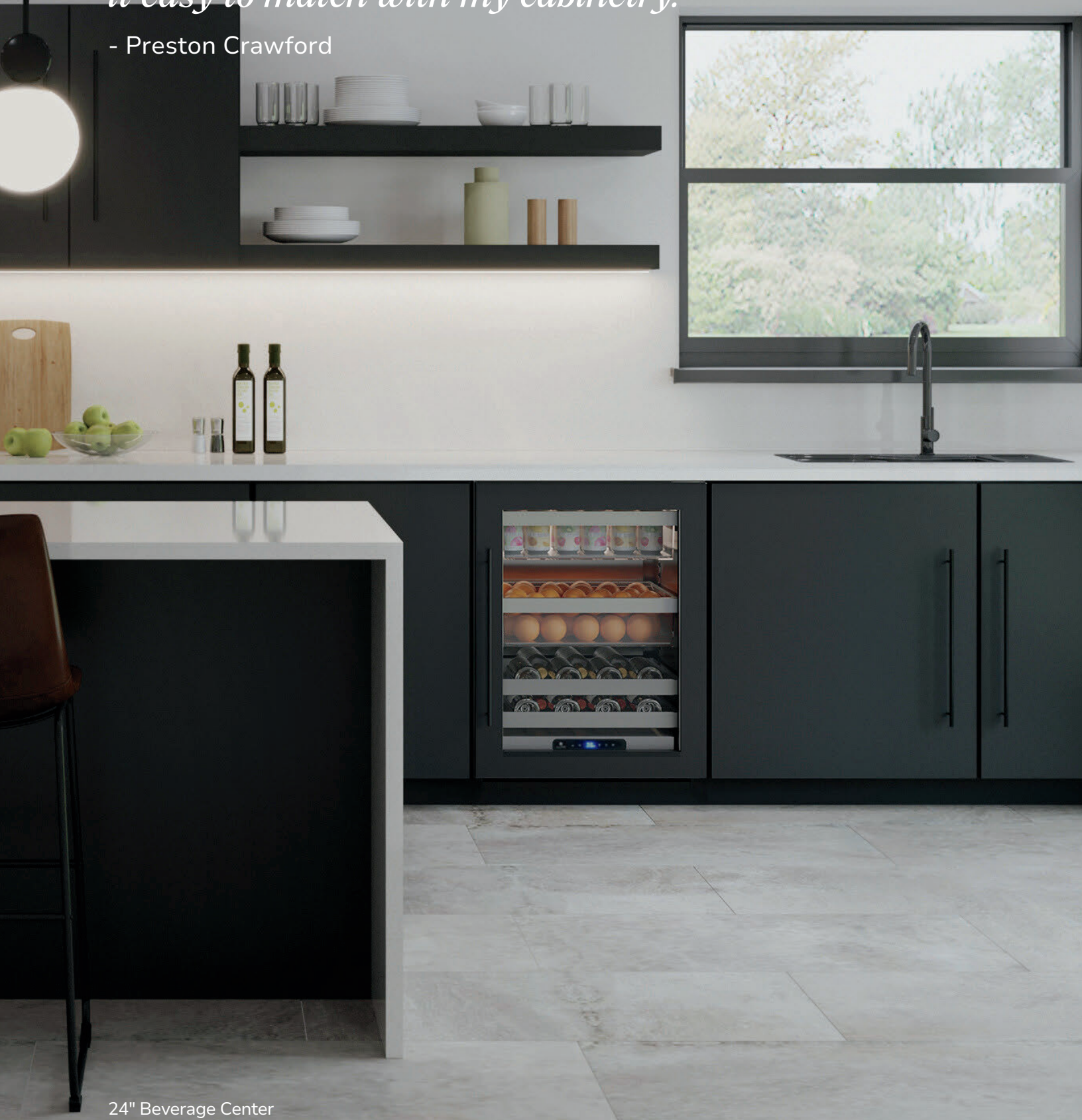
24" Beverage Center